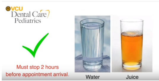
Figure 1: Sample of Still Image Presenting Information in Pre-Procedural Video